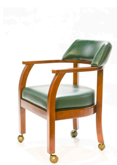
*shown with optional metal ball casters

superior mobility on carpet optional metal ball casters available on armchair (NWD-100-C)