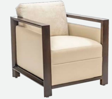
HAM-100-W Wood Armchair

Seat H: 19.0 in; Overall H: 32.5 in Seat W: 22.0 in; Overall W: 31.0 in Seat D: 22.3 in; Overall D: 33.0 in