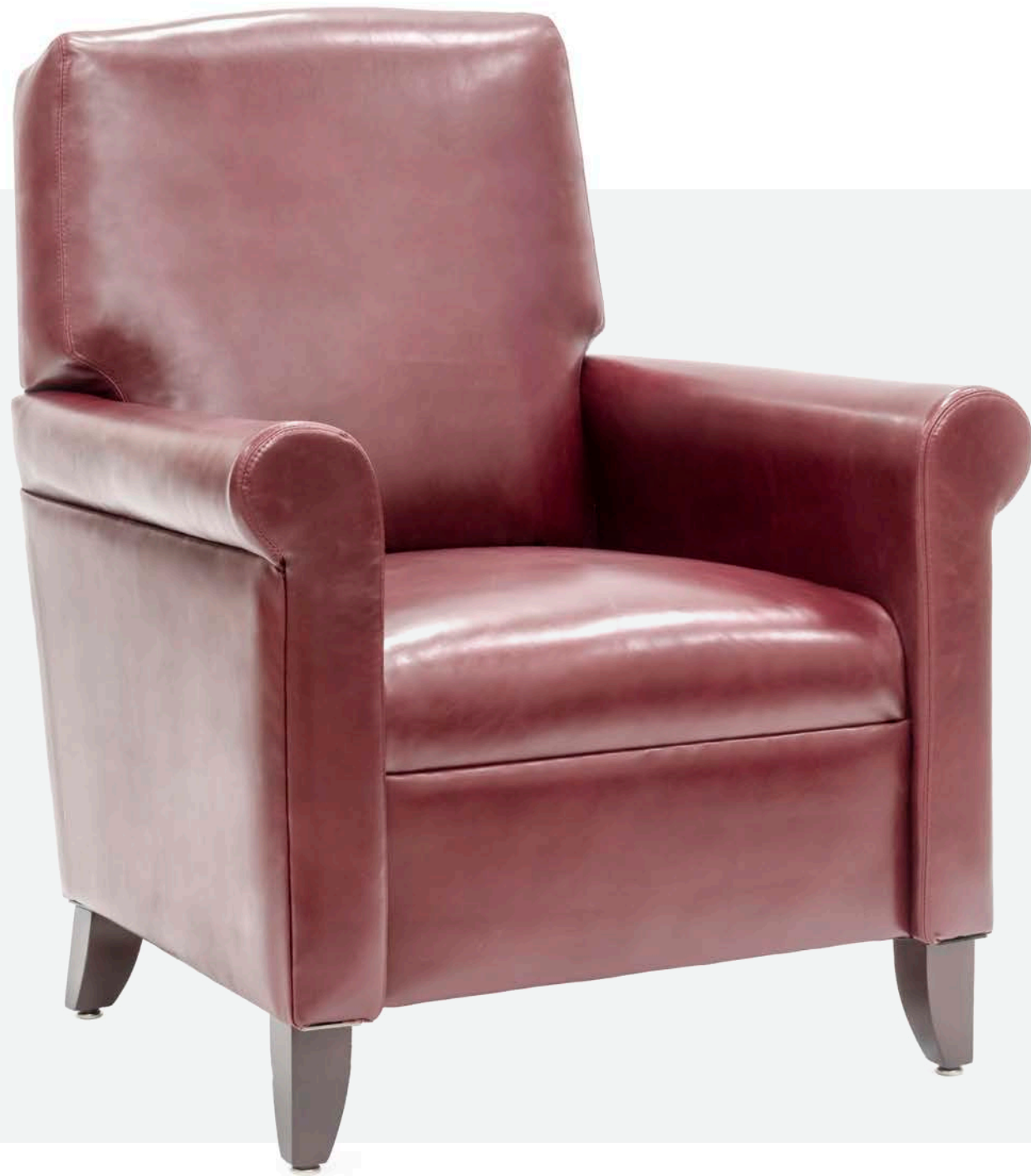
MAX-101 Armchair - Tall Back

A CLASSIC COLLECTION FEATURING ALL HARDWOOD FRAMES, ROLLED ARMS, AND SPRUNG SEATS THAT GIVES YOUR GUESTS THE VIP TREATMENT