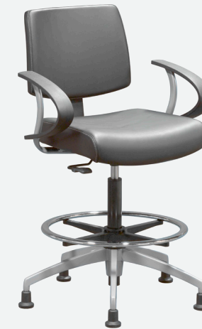
GEN-100-B Task Stool

Shown with Optional Adjustable Poly Arms