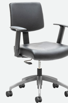
GEN-100 Task Chair

Seat H: 17.0-20.0 in Overall H: 29.0-32.0 in Seat W: 18.0 in; Overall W: 25.5 in Seat D: 18.5 in; Overall D: 27.0 in