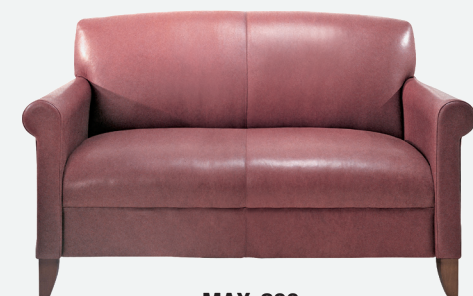
MAX-200 Loveseat Seat H: 19.0 in; Overall H: 34.0 in Seat W: 44.0 in; Overall W: 56.0 in Seat D: 21.5 in; Overall D: 33.0 in