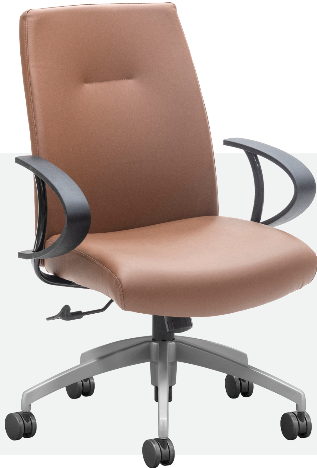
GEN-201 Mid Back

A STYLISH, CONTEMPORARY COLLECTION OF FOUR DISTINCT TASK SEATING MODELS ENGINEERED FOR SUPERIOR MOBILITY, FLEXIBILITY, COMFORT AND BODY SUPPORT