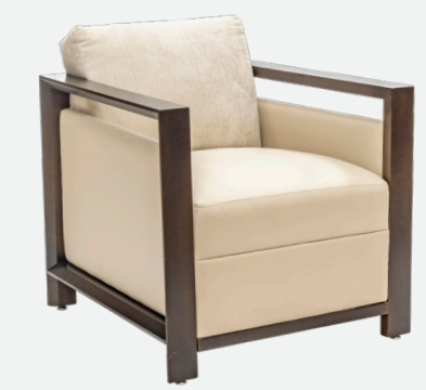
HAM-100-W Wood Armchair

Seat H: 19.0 in; Overall H: 32.5 in Seat W: 22.0 in; Overall W: 31.0 in Seat D: 22.3 in; Overall D: 33.0 in