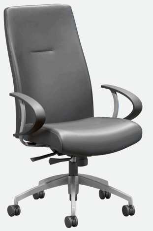
GEN-202 High Back

Seat H: 17.0-20.0 in Overall H: 37.5-40.5 in Seat W: 20.0 in; Overall W: 25.5 in Seat D: 18.5 in; Overall D: 27.0 in