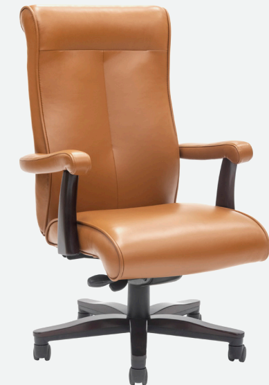
PAR-102 High Back

Seat H: 19.0-23.0 in; Overall H: 41.0-45.0 in Seat W: 21.0 in; Overall W: 26.5 in Seat D: 18.0 in; Overall D: 27.5 in