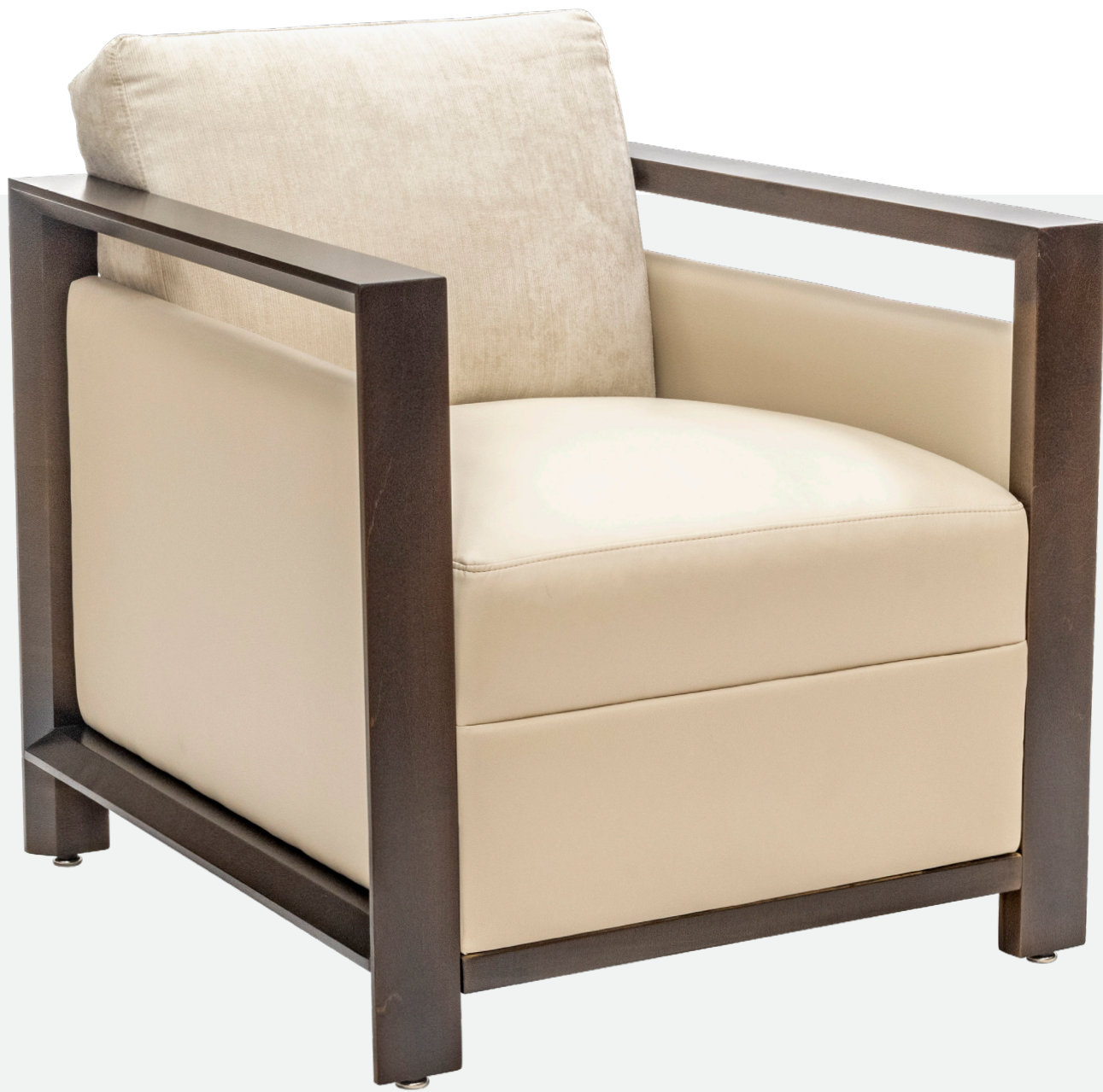
HAM-100-W Wood Armchair

A COLLECTION OF CONTEMPORARY LOUNGE SEATING THAT EVOKES A MID-CENTURY GEOMETRIC APPEARANCE IN A BROAD RANGE OF MODELS AND STYLES