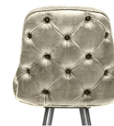
HAND-PLEATED, DIAMOND TUFTING