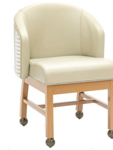
PAV-114-C Wraparound Back Shown with Optional Head-to-Head Tacking and Metal Ball Casters