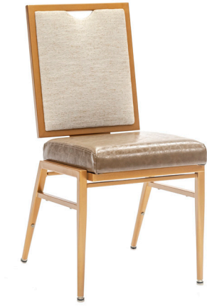
IDO-103 Shown with Optional Crescent Handle