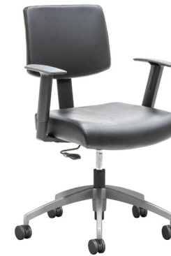
GEN-100 Shown with Optional Adjustable Poly Arms