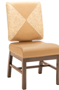
PAV-100 Square Back

FEATURED MODEL: PAV-114-B Shown with Optional Head-to-Head Tacking