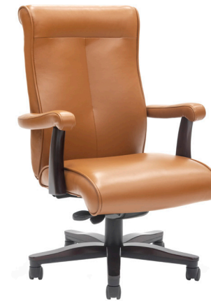
PAR-101 Mid Back

FEATURED MODEL: PAR-102 Shown with Optional Upholstered Arms and Wood Capped Base