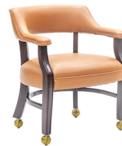
LNT-100 Shown with Optional Metal Ball Casters