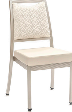
GTW-103 Shown with Optional Integrated Handle