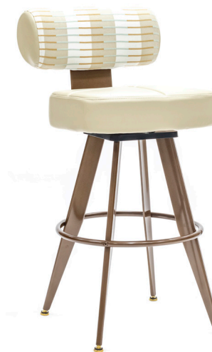
GIB-100-B Barrel Back