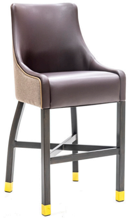
CNL-100-M-B Shown with Optional Aluminum Base