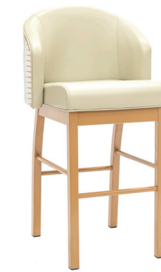
PAV-114-B Wraparound Back Shown with Optional Head-to-Head Tacking