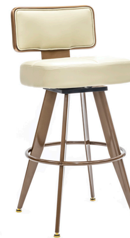
GIB-101-B Flat Back