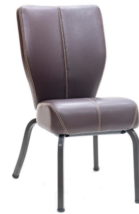
NPT-100 Shown with Optional Accent Stitching

FEATURED MODEL: NPT-100 Shown with Optional Accent Stitching