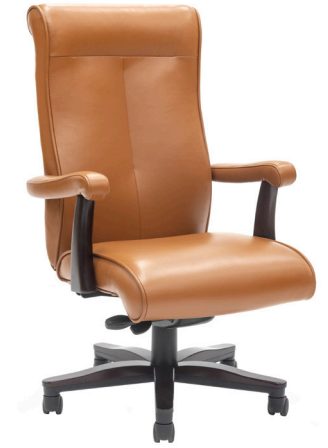
PAR-102 High Back

Shown with Optional Upholstered Arms and Wood Capped Base