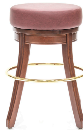
BWS-100 Shown with Optional Brass Plated Footrest

FEATURED MODEL: BWS-100 Shown with Optional Brass Plated Footrest