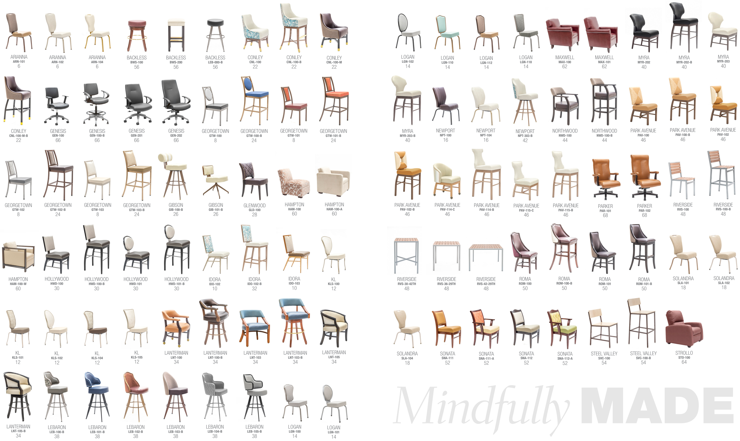
ARIANNA ARN-101 6 ARIANNA ARN-102 6 ARIANNA ARN-104 6 BACKLESS BWS-100 56 BACKLESS BWS-200 56 BACKLESS LEB-000-B 56 CONLEY CNL-100 22 CONLEY CNL-100-B 22 CONLEY CNL-100-M 22 LOGAN LGN-102 14 LOGAN LGN-110 14 LOGAN LGN-112 14 LOGAN LGN-118 14 MAXWELL MAX-100 62 MAXWELL MAX-101 62 MYRA MYR-202 40 MYRA MYR-202-B 40 MYRA MYR-203 40 CONLEY CNL-100-M-B 22 GENESIS GEN-100 66 GENESIS GEN-100-B 66 GENESIS GEN-201 66 GENESIS GEN-202 66 GEORGETOWN GTW-100 8 GEORGETOWN GTW-100-B 24 GEORGETOWN GTW-101 8 GEORGETOWN GTW-101-B 24 MYRA MYR-203-B 40 NEWPORT NPT-100 16 NEWPORT NPT-104 16 NEWPORT NPT-303-B 42 NORTHWOOD NWD-100 44 NORTHWOOD NWD-100-B 44 PARK AVENUE PAV-100 46 PARK AVENUE PAV-100-B 46 PARK AVENUE PAV-102 46 GEORGETOWN GTW-102 8 GEORGETOWN GTW-102-B 24 GEORGETOWN GTW-103 8 GEORGETOWN GTW-103-B 24 GIBSON GIB-100-B 26 GIBSON GIB-101-B 26 GLENWOOD GLD-100 28 HAMPTON HAM-100 60 HAMPTON HAM-100-A 60 PARK AVENUE PAV-102-B 46 PARK AVENUE PAV-114-C 46 PARK AVENUE PAV-114-B 46 PARK AVENUE PAV-115-C 46 PARK AVENUE PAV-115-B 46 PARKER PAR-101 68 PARKER PAR-102 68 RIVERSIDE RVS-100 48 RIVERSIDE RVS-100-B 48 HAMPTON HAM-100-W 60 HOLLYWOOD HWD-100 30 HOLLYWOOD HWD-100-B 30 HOLLYWOOD HWD-101 30 HOLLYWOOD HWD-101-B 30 IDORA IDO-102 10 IDORA IDO-102-B 32 IDORA IDO-103 10 KL KLS-100 12 RIVERSIDE RVS-30-42TH 48 RIVERSIDE RVS-36-29TH 48 RIVERSIDE RVS-42-29TH 48 ROMA ROM-100 50 ROMA ROM-100-B 50 ROMA ROM-101 50 ROMA ROM-101-B 50 SOLANDRA SLA-101 18 SOLANDRA SLA-102 18 KL KLS-101 12 KL KLS-102 12 KL KLS-104 12 KL KLS-105 12 LANTERMAN LNT-100 34 LANTERMAN LNT-100-B 34 LANTERMAN LNT-103 34 LANTERMAN LNT-103-B 34 LANTERMAN LNT-105 34 SOLANDRA SLA-104 18 SONATA SNA-111 52 SONATA SNA-111-A 52 SONATA SNA-112 52 SONATA SNA-112-A 52 STEEL VALLEY SVC-100 54 STEEL VALLEY SVC-100-B 54 STROLLO STO-100 64 LANTERMAN LNT-105-B 34 LEBARON LEB-100-B 38 LEBARON LEB-101-B 38 LEBARON LEB-102-B 38 LEBARON LEB-103-B 38 LEBARON LEB-104-B 38 LEBARON LEB-105-B 38 LOGAN LGN-100 14 LOGAN LGN-101 14