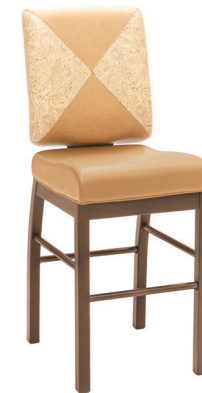
PAV-100-B Square Back