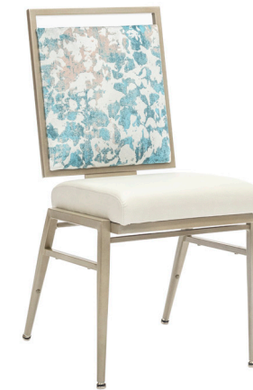
IDO-102 Shown with Optional Integrated Handle

FEATURED MODEL: IDO-103 Shown with Optional Crescent Handle and Retractable Ganging Brackets (GB2)