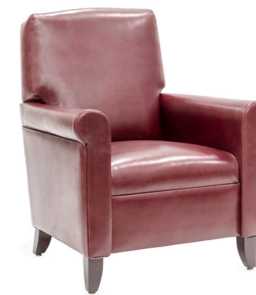
MAX-101 Tall Back