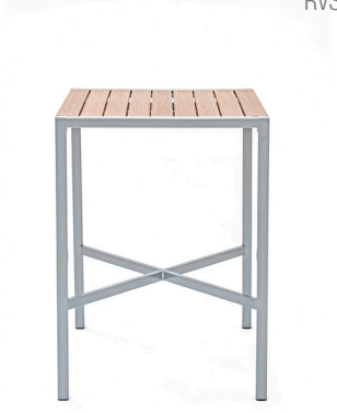
RVS-30-42TH High Top