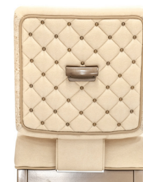
SEWN, TACK TUFTING

All upholstery options may not fit all models.