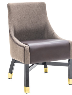
CNL-100-M Shown with Optional Aluminum Base