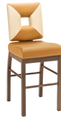
PAV-102-B Window Back