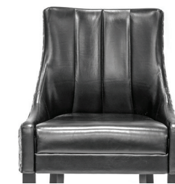
CHANNEL SEWN TUFTING