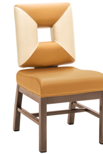
PAV-102 Window Back