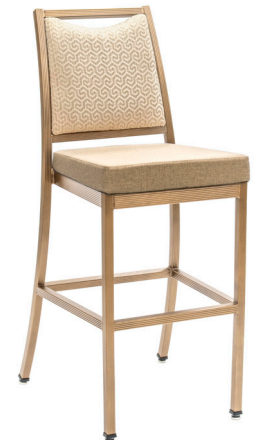
GTW-103-B Shown with Optional Integrated Handle