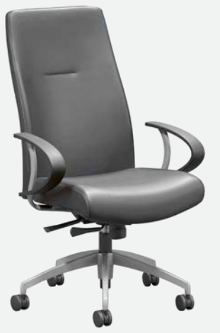
GEN-202 High Back

Seat H: 18.5-22.5 in Overall H: 39.0-43.0 in Seat W: 20.0 in; Overall W: 25.5 in Seat D: 18.5 in; Overall D: 27.0 in