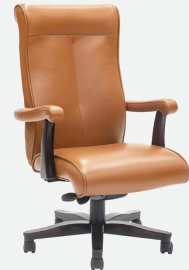
PAR-102 High Back

Seat H: 19.0-23.0 in; Overall H: 41.0-45.0 in Seat W: 21.0 in; Overall W: 26.5 in Seat D: 18.0 in; Overall D: 27.5 in