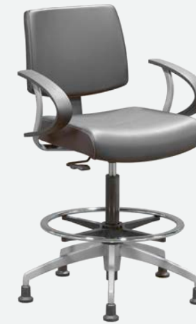
GEN-100-B Task Stool

Shown with Optional Adjustable Poly Arms