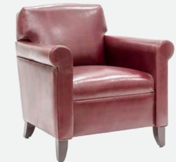
MAX-100 Armchair - Short Back Seat H: 19.0 in; Overall H: 34.0 in Seat W: 21.5 in; Overall W: 33.0 in Seat D: 23.0 in; Overall D: 33.0 in