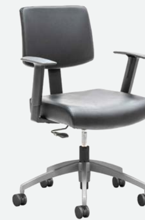
GEN-100 Task Chair

Seat H: 18.0-24.0 in Overall H: 30.0-36.0 in Seat W: 18.0 in; Overall W: 25.5 in Seat D: 18.5 in; Overall D: 27.0 in