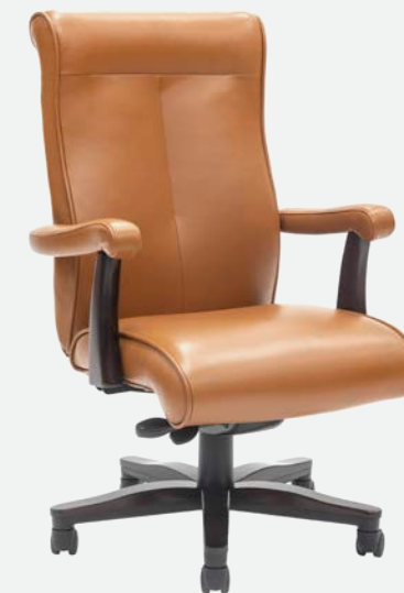
PAR-101 Mid Back

Seat H: 19.0-23.0 in; Overall H: 41.0-45.0 in Seat W: 21.0 in; Overall W: 26.5 in Seat D: 18.0 in; Overall D: 27.5 in