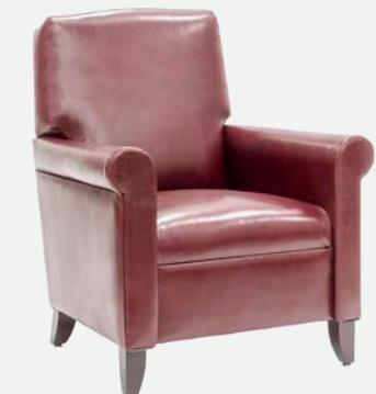
MAX-101 Armchair - Tall Back Seat H: 19.0 in; Overall H: 39.0 in Seat W: 21.5 in; Overall W: 33.0 in Seat D: 21.5 in; Overall D: 33.0 in