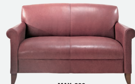
MAX-200 Loveseat Seat H: 19.0 in; Overall H: 34.0 in Seat W: 44.0 in; Overall W: 56.0 in Seat D: 21.5 in; Overall D: 33.0 in