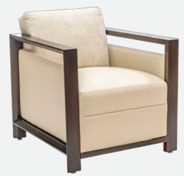
HAM-100-W Wood Armchair

Seat H: 19.0 in; Overall H: 32.5 in Seat W: 22.0 in; Overall W: 31.0 in Seat D: 22.3 in; Overall D: 33.0 in