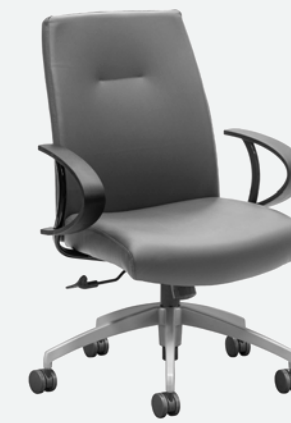
GEN-201 Mid Back

Seat H: 18.5-22.5 in Overall H: 39.0-43.0 in Seat W: 20.0 in; Overall W: 25.5 in Seat D: 18.5 in; Overall D: 27.0 in