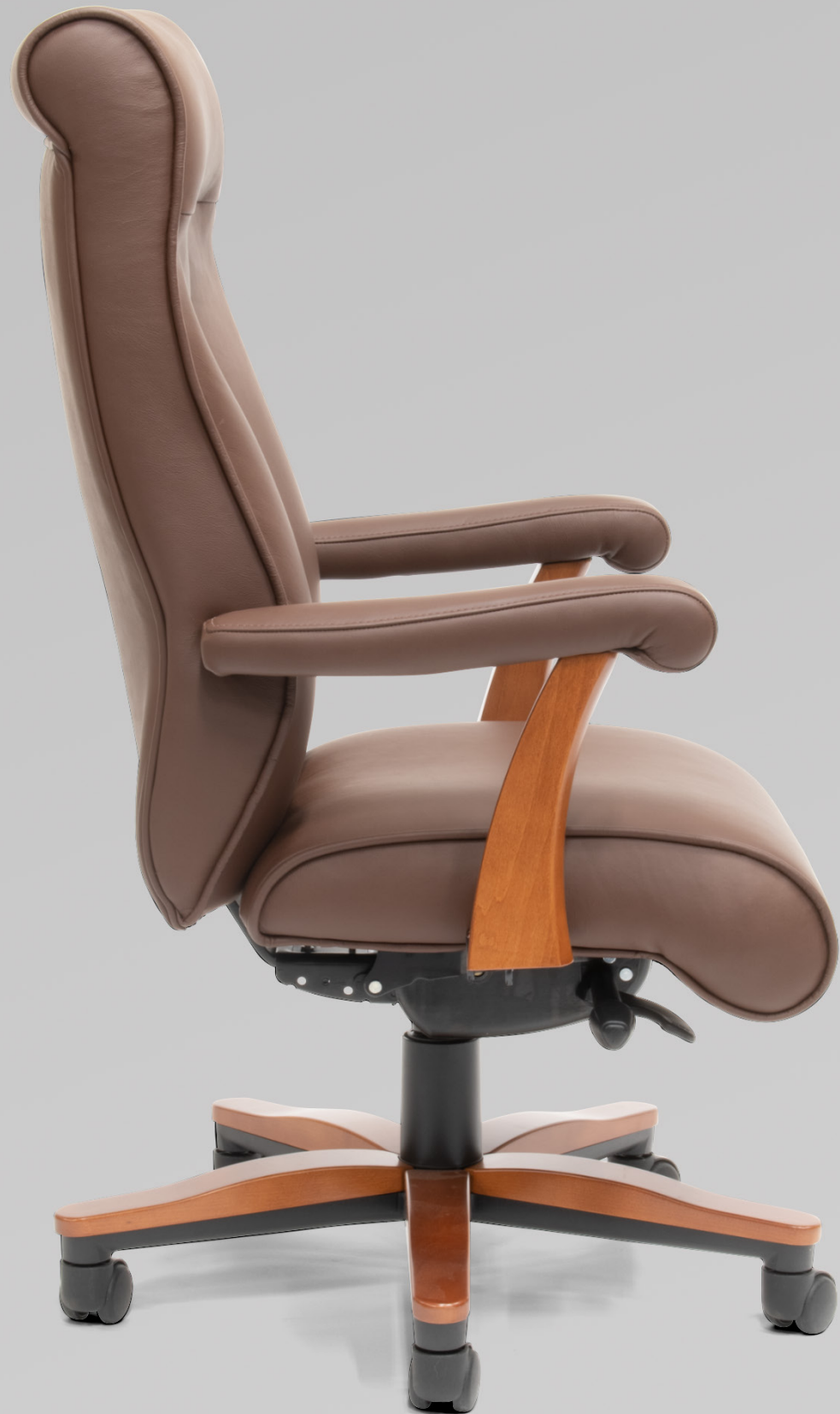
Shown with Optional Wood Capped 5-Vane Base and Upholstered Wood Arms